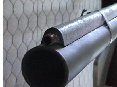
Optional HTM Channel reduces waste, weather protects and eliminates curing requirements