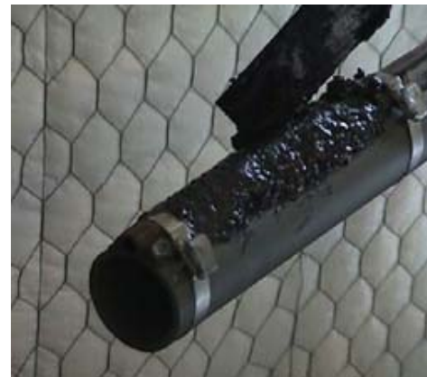
Typical hand trowel application